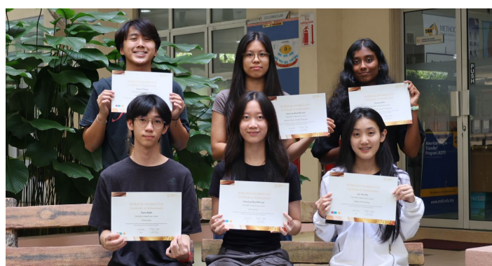
Bronze Team Award Winners