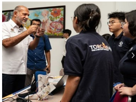
Minister of Digital, YB Tuan Gobind Singh Deo, visits the MCKL College Penang, Pykett Campus team's booth at the National AI Competition 2025.

as healthcare, education, sustainability and public services.