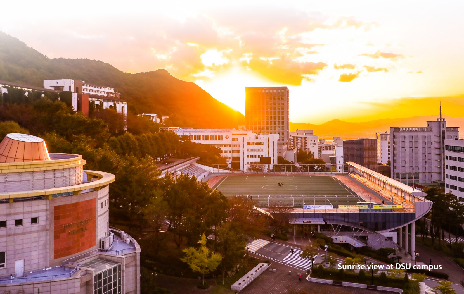
Sunrise view at DSU campus

immersing themselves in a rich cultural and academic environment. This collaboration reflects our shared commitment to expanding global opportunities and nurturing future-ready graduates. We look forward to seeing our students thrive in DSU's dynamic learning community and to building a lasting relationship between our institutions.