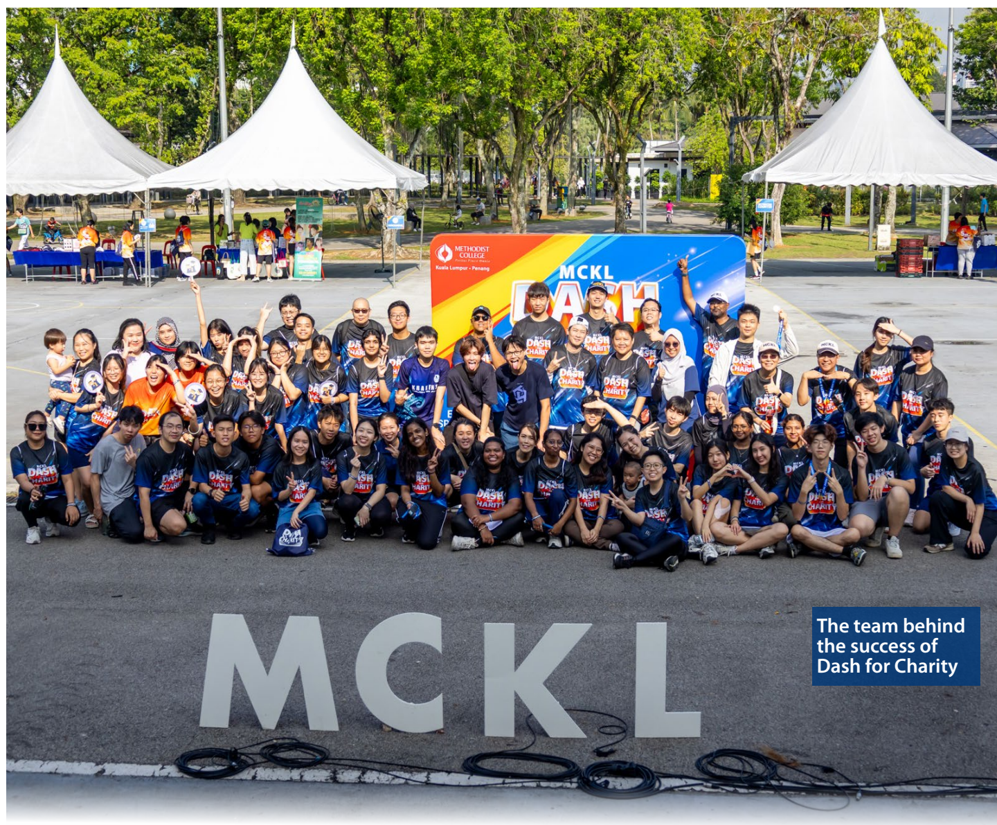
The team behind the success of Dash for Charity