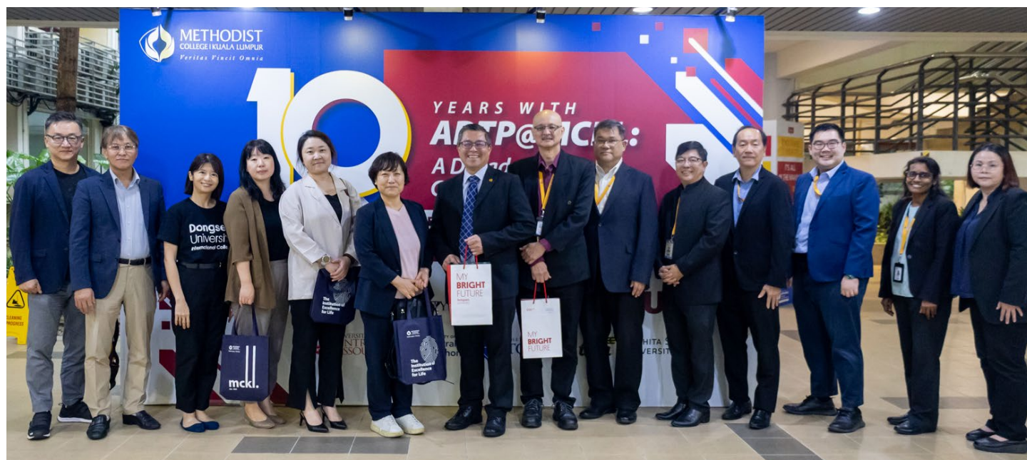
Representative from MCKL and DSU