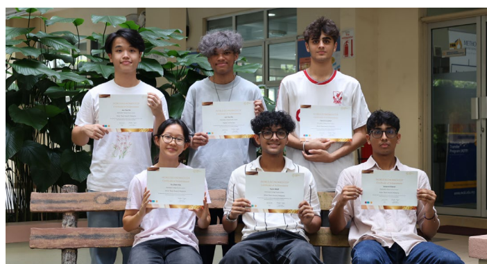
Silver Team Award Winners