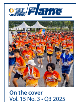
On the cover Vol. 15 No. 3 • Q3 2025